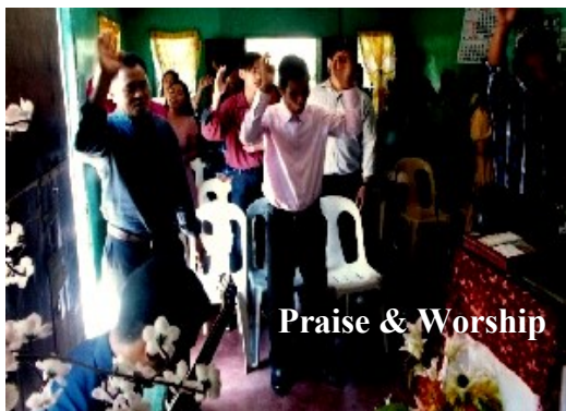
Praise & Worship