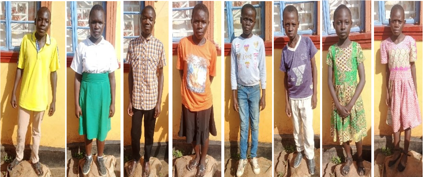
These are 15 of the 68 orphans in Migori that we support. I will prepare a separate mailing with the rest of the photos