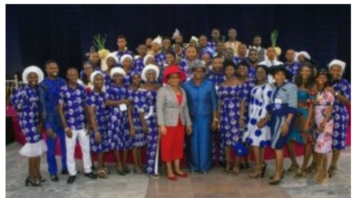
Nigerian Church of God members.