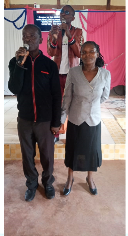
Scenes from Migori Church of God